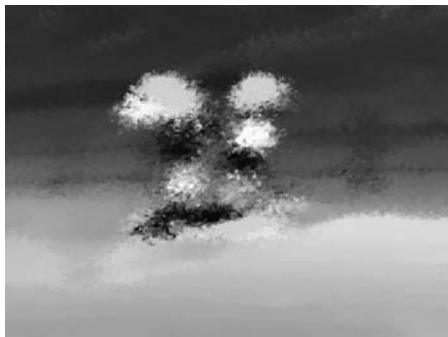
The beginning of the story of \pi : Pi-henge

sense, numbers that existed were numbers that could be drawn with just an unmarked ruler and compass. The rules allowed for starting with a fixed length of 1 and seeing what could be constructed with straight edge and compass alone. (Our current notion is much more based on counting.) The question of whether \pi is a constructible magnitude had been explicitly raised as a question by the sixth century BC and the time of the Pythagoreans. Unfortunately \pi is not constructible, though a proof of this would not be available for several thousand years. In this context there isn't a more basic question than "is \pi a number?" Of course, our more modern notion of number embraces the Greek notion of constructible and doesn't depend on construction. The existence of \pi as a number given by an infinite (albeit unknown) decimal expansion poses little problem.